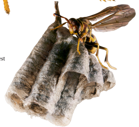
Adult Paper Wasp on a Nest