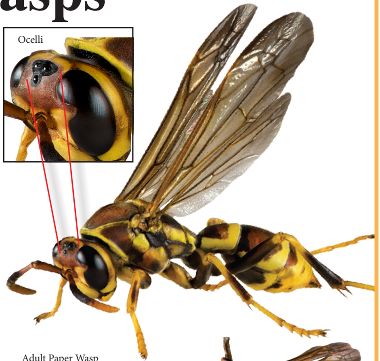
Adult Paper Wasp